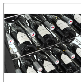
Wine shelves as option